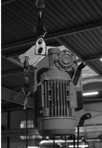
LM 300 S electric work site hoist with a reeving kit