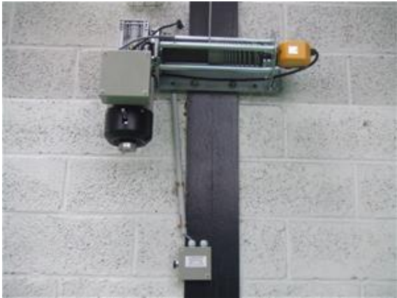
Basketball hoist