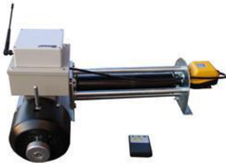
Basketball backboard lifting hoist with remote control