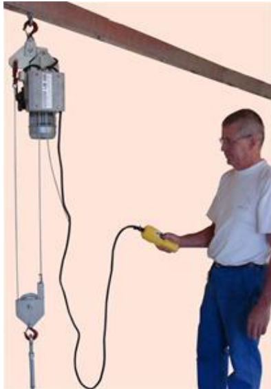
LM 300 work site hoist with tackle block