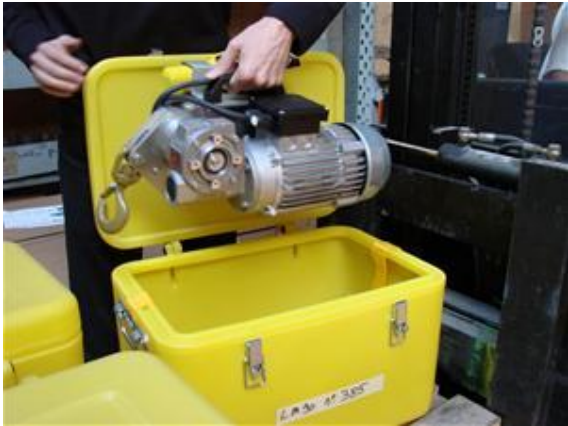
LM 90 work site hoist and its storage cabinet

The LM 90 electric work site hoist is a passing wire-rope hoist, providing unrestricted working height. The LM 90 work site hoist is easy to transport, easy to install and is not very bulky.