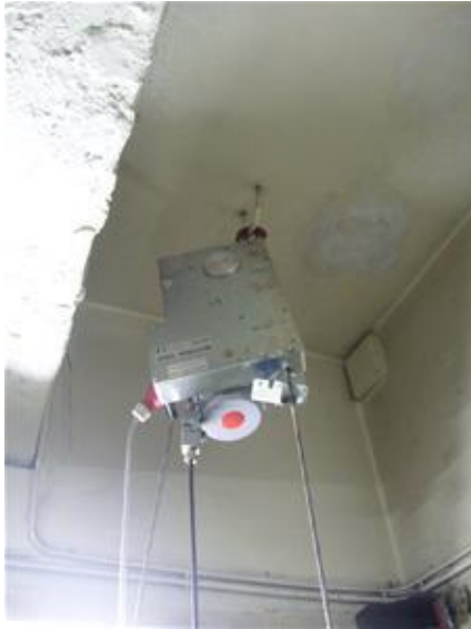
Electric hoist MOTRIX® 500