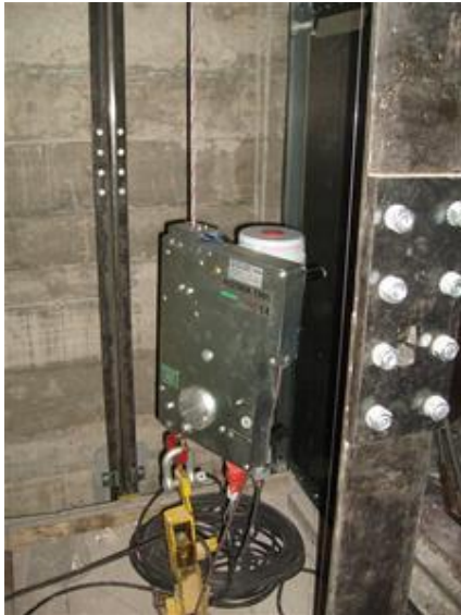
Electric hoist MOTRIX ® 1000