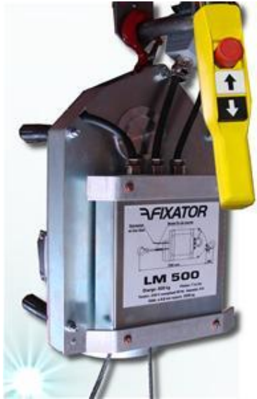
LM 500 electric hoist on suspension beam

The LM 500 electric work site hoist is a hoist with passing wire-rope system enabling unrestricted wire-rope stroke.